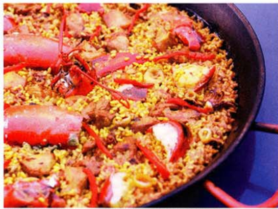
Hungry diners are choosing hearty paella over tiny tapas plates.